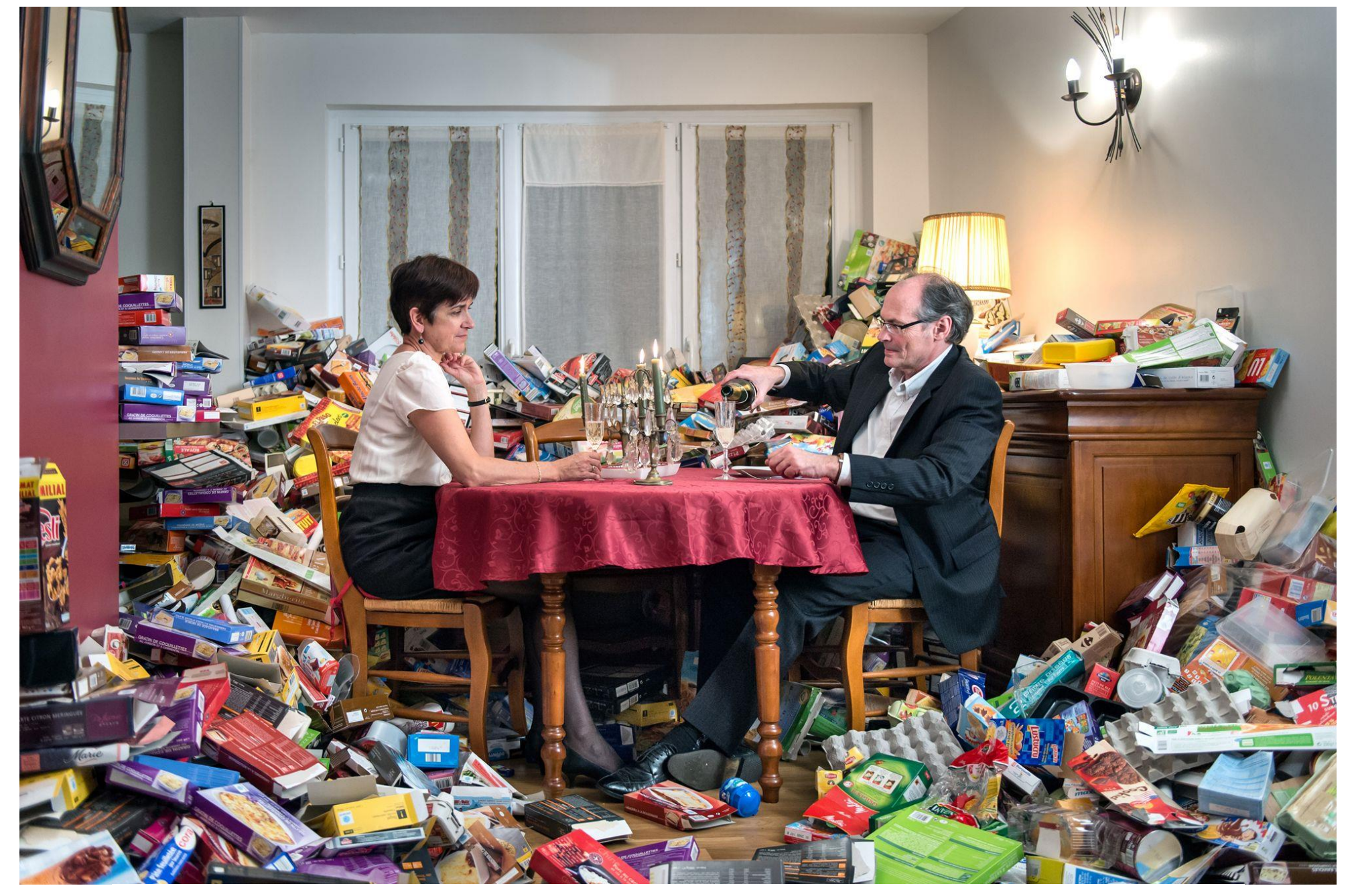
Antoine Repessé, "365, Unpacked" (2016)