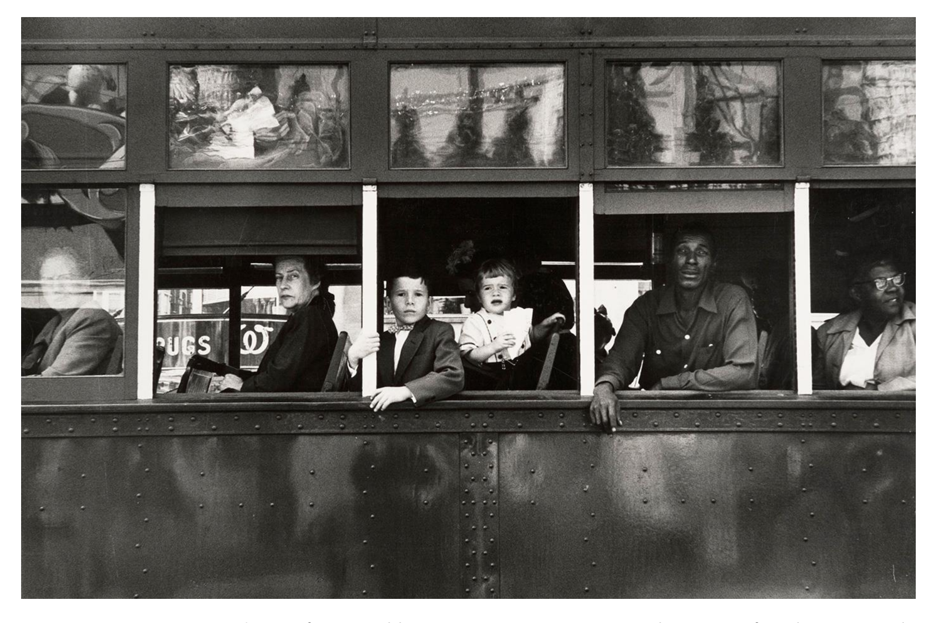
Robert Frank, "Trolley - New Orleans" (1965), from "In America"