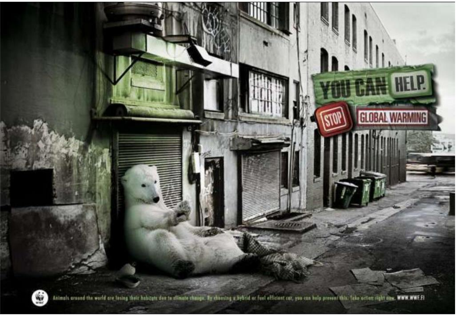
WWF "You can help stop global warming" advertising campaign